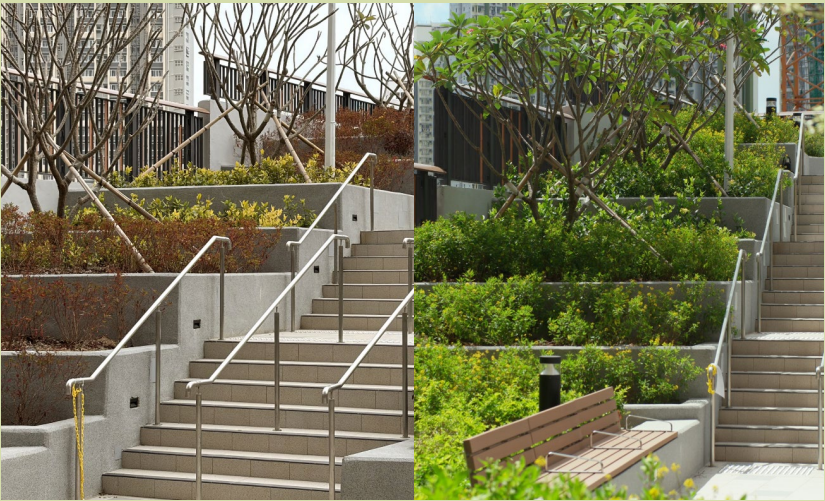
於層疊的花槽種植季節性植物，以呼應採石場的主題 Staggered planters with seasonal species to echo with the quarry theme