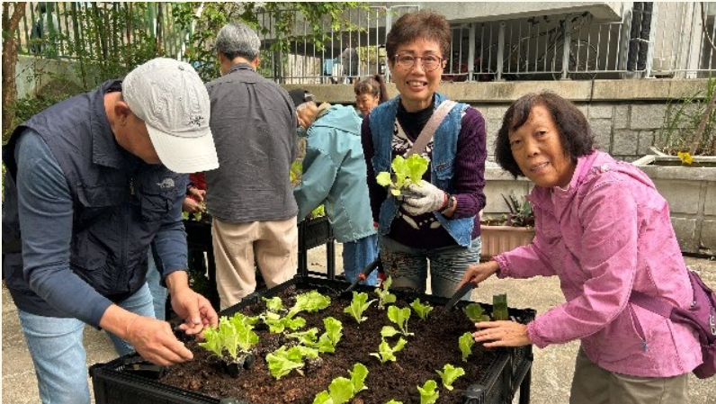
順安邨社區農圃計劃 Shun On Estate Community Garden Programme

香港房屋委員會肩負環保責任，期望提高公屋居民對環保和可持續發展的意識，並舉辦環保活動，讓租戶為環保出一分力。年內我們在多個屋邨推行一系列社區農圃計劃和社區綠化計劃，向居民宣傳環保措施，加強公眾教育。