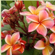
紅雞蛋花 Plumeria rubra