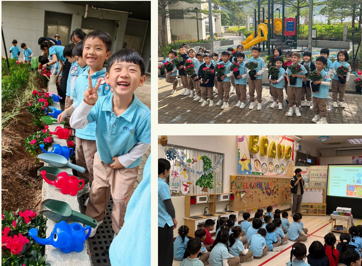
迎東邨社區綠化計劃 Ying Tung Estate Community Greening Promotional Programmes