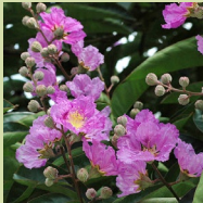
大花紫薇 Lagerstroemia speciosa