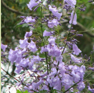
藍花楸 Jacaranda mimosifolia