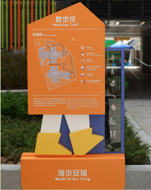
主題標誌設計 Thematic signage design