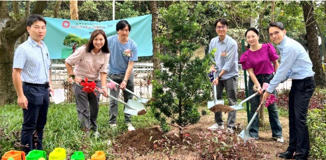
順天邨植樹日 Shun Tin Estate Tree Planting Day