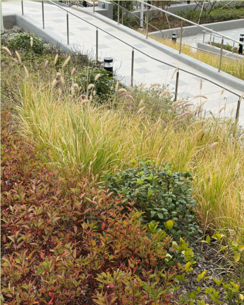
種植了觀賞性草類植物，以呈現周邊的山勢及粗獷自然地貌，並呼應昔日採石場的歷史背景 Ornamental grasses are planted to resemble the rugged natural characteristics of the surrounding hills and echo the history of a quarry